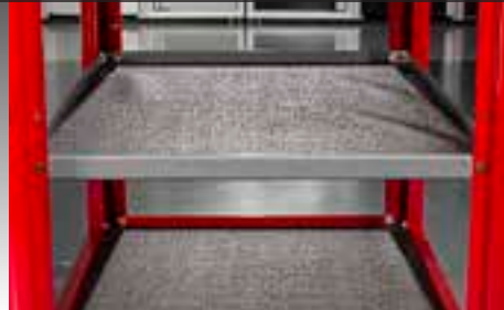
SHELF - 2 adjustable heights