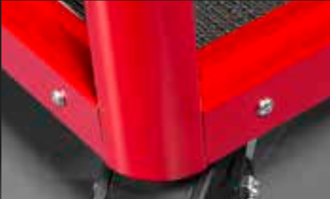
RADIUS CORNERS - extrusion