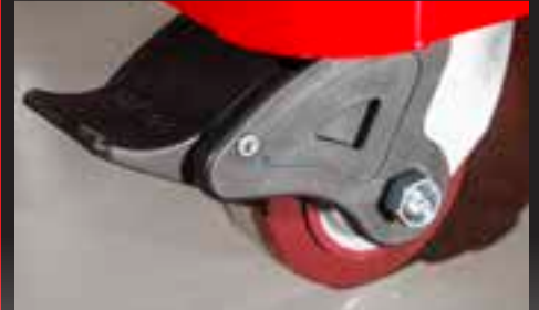
4" RIGID CASTERS