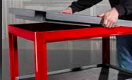
REMOVABLE - INVERTED TRAY