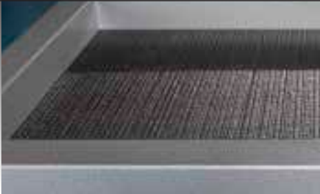
LINER - shelves and drawers